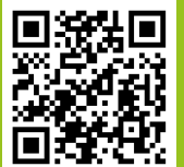
Ceremony Video in 3 regions