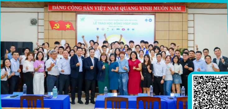
Can Tho city