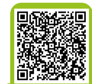
Summit in HCM post